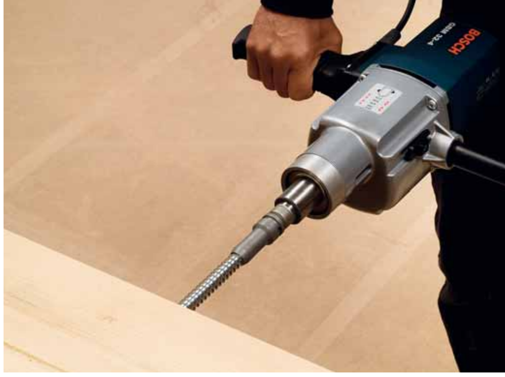
4. Install the threaded bar using a drill with high torque.