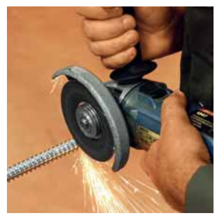
3. Cut threaded bar to exactly the required length using metal saw or right-angle grinder.